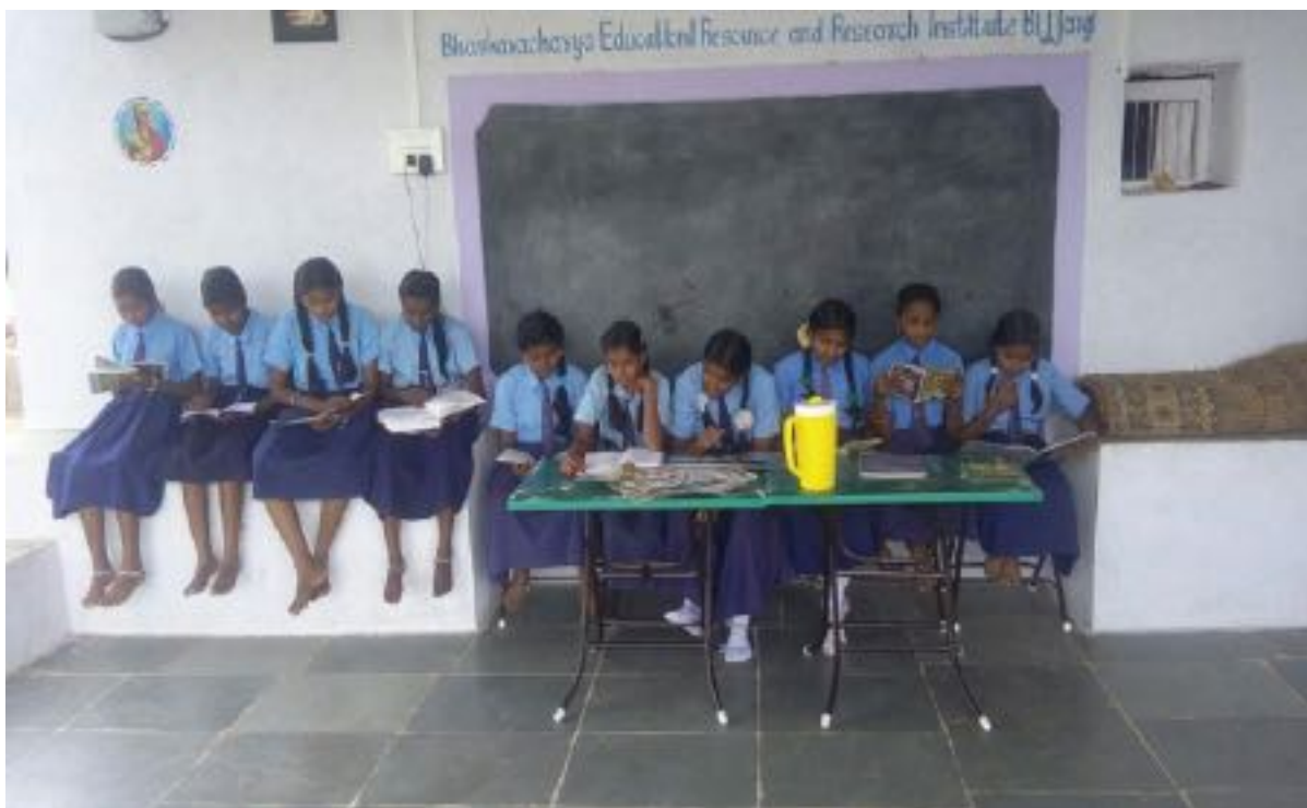
Children Reading Books, Magazines and Newspapers