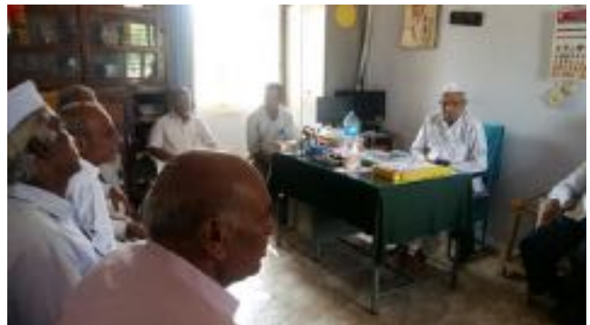
Early Meetings of Berri-Bijjargi Formation