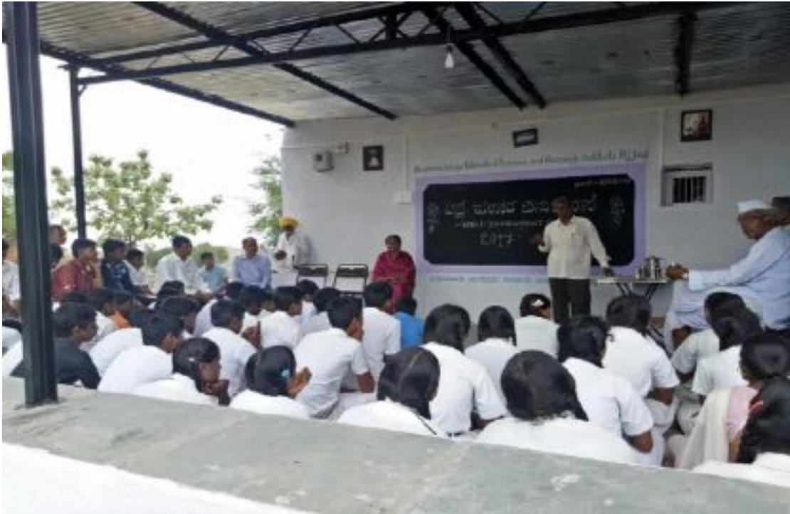
Discussion on environmental issues with students