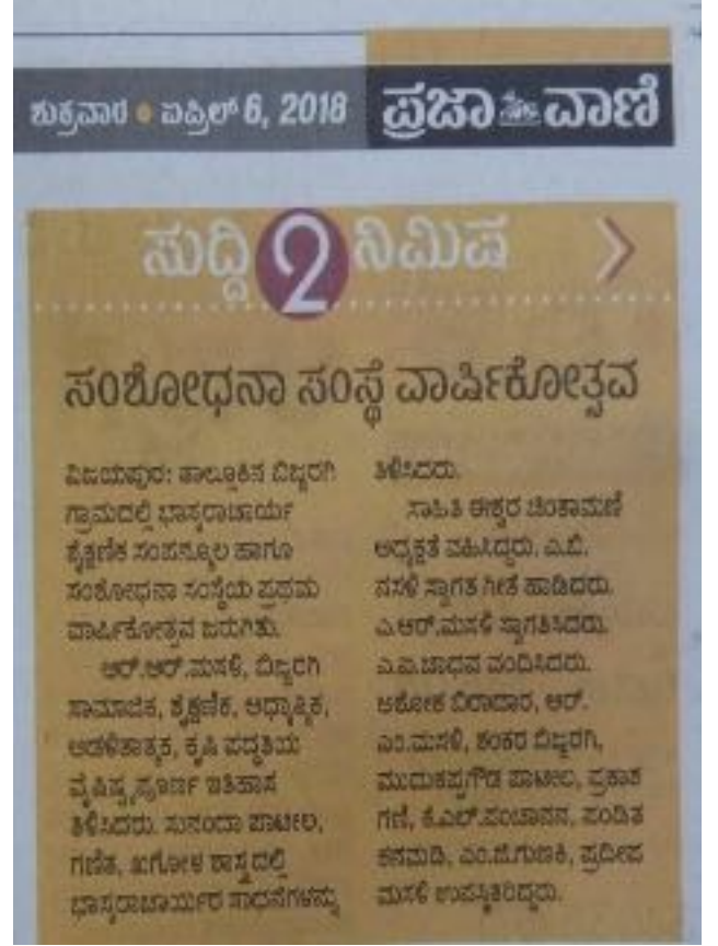
Newspaper Report related to 1 st anniversary programme in Prajavani on 4 th April & 6 th April, 2018