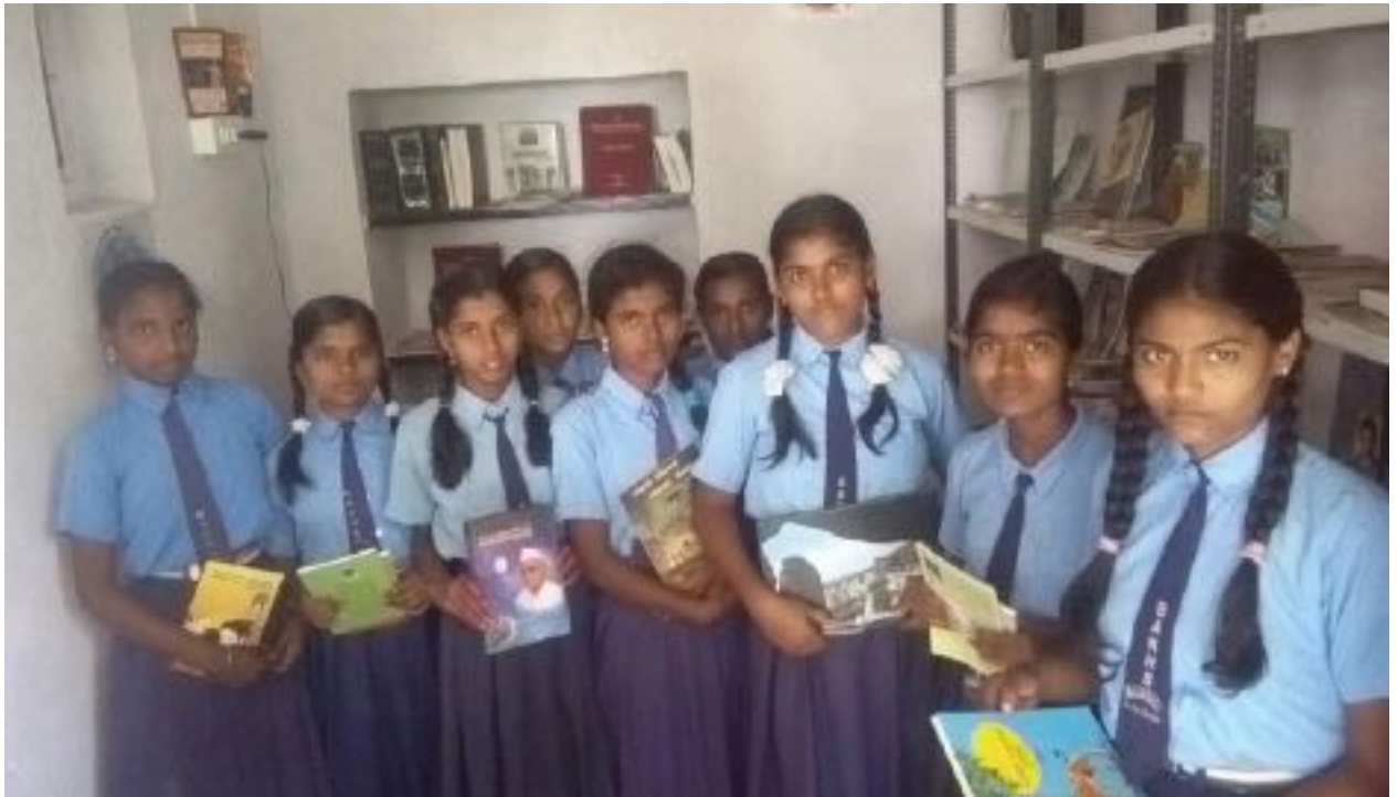
Children in the Library