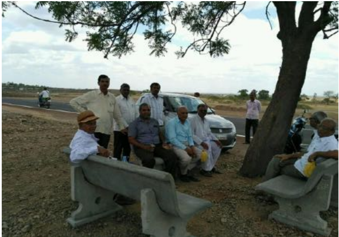
Benches in use under the Neem Tree

They will also provide a comfortable resting place for passers-by travelling on this highway, during the day.