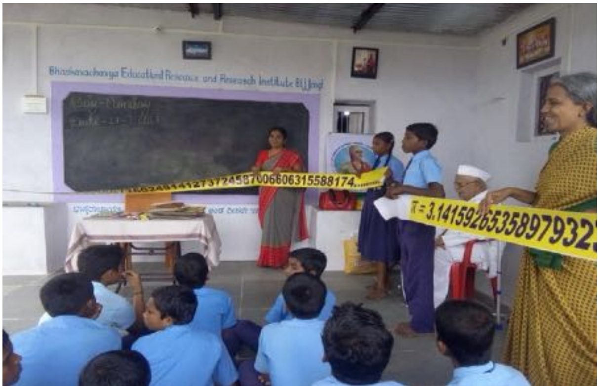
Never ending Value of \pi (Pi)...