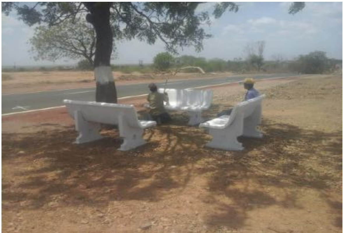
Painting work in progress