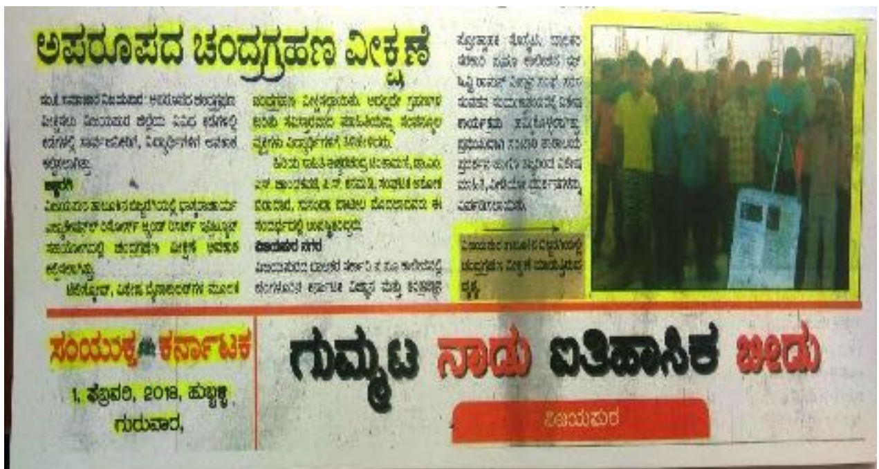
Lunar Eclipse Viewing Programme Report in Samyukta Karnataka 1 st Feb, 2018