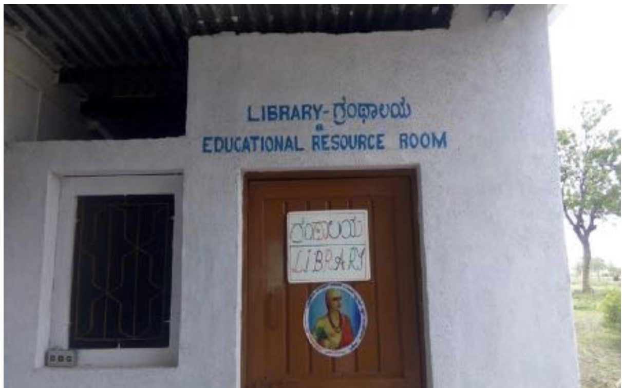
The new Library