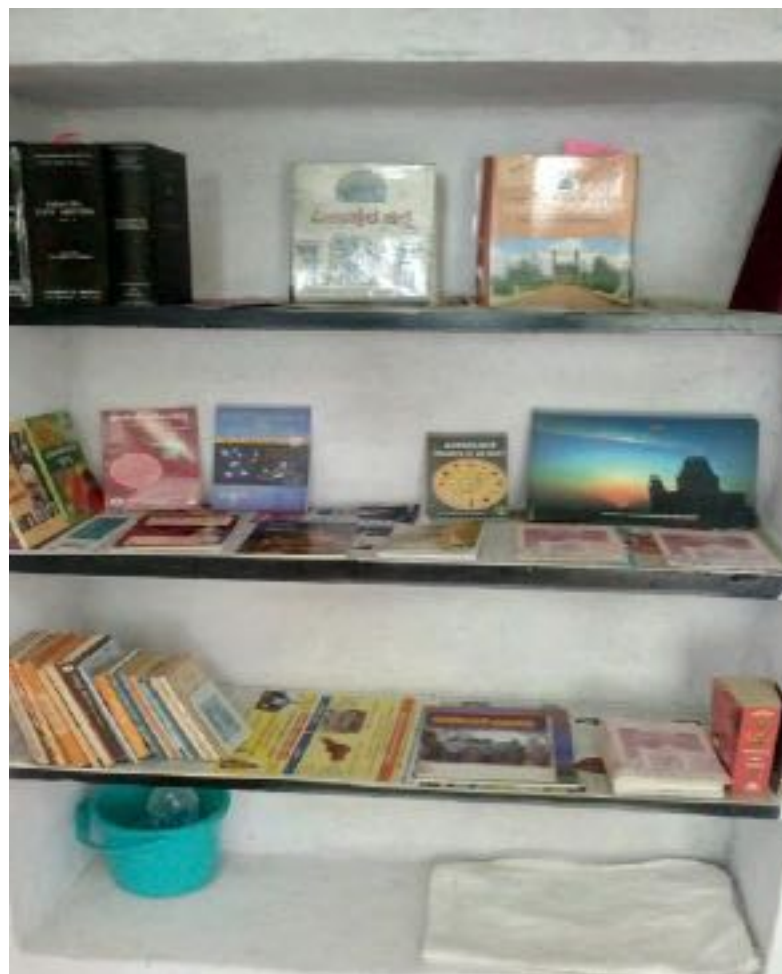
Books on History and other subjects