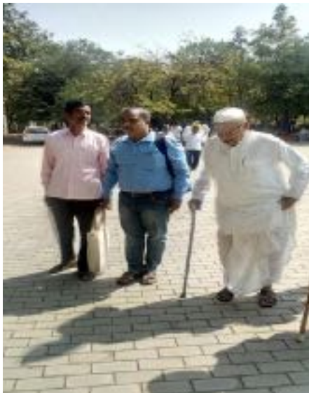
Trustees At Jnanayoga Ashram, Bijapur