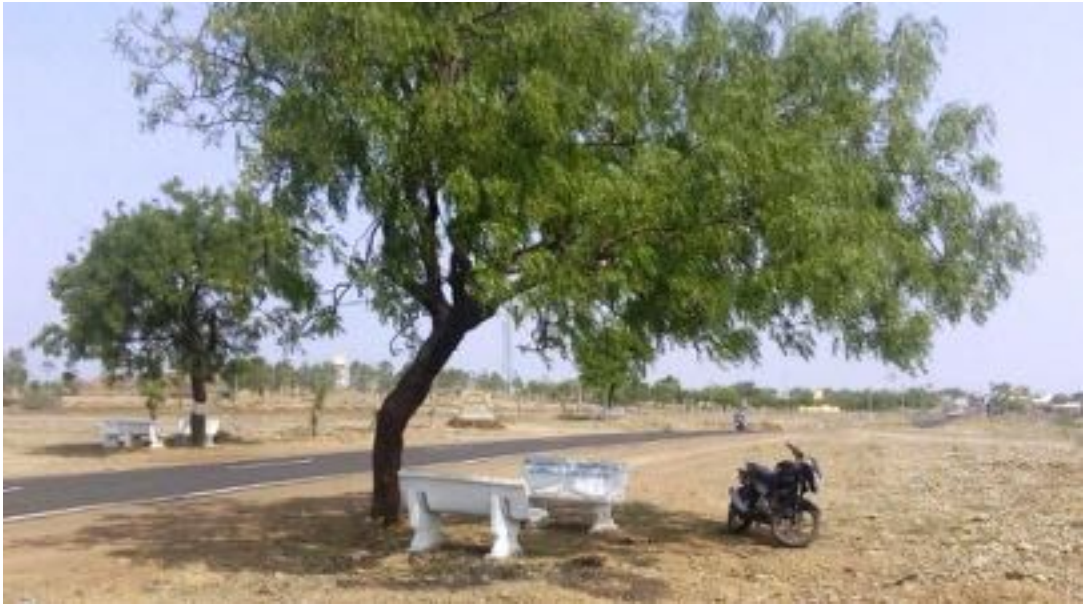
Benches near Berri-Bijjargi Campus