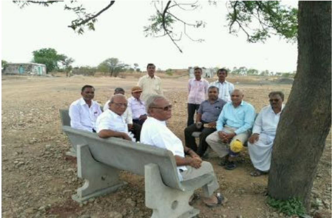
Benches in use under the Neem Tree