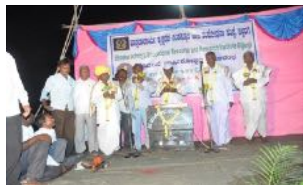
Cultural Programme and Felicitation of Artists