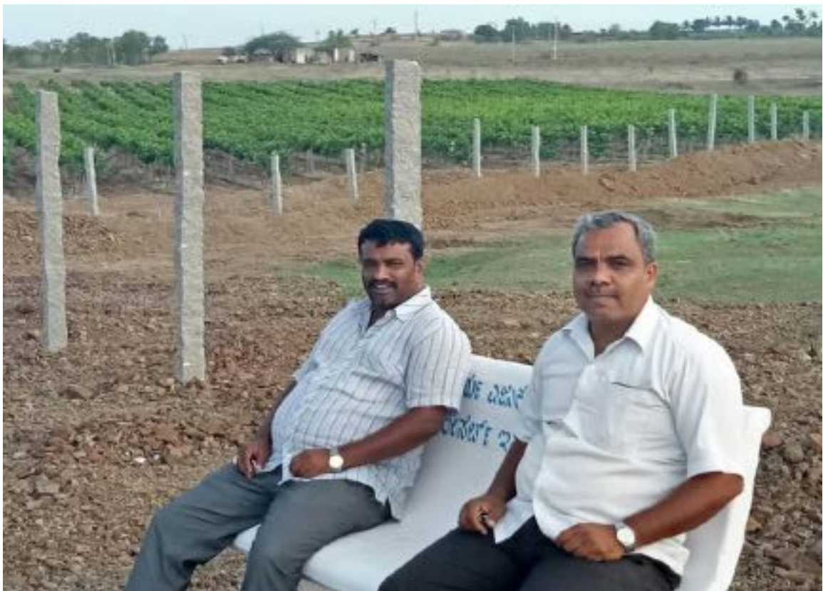
Resting on the benches