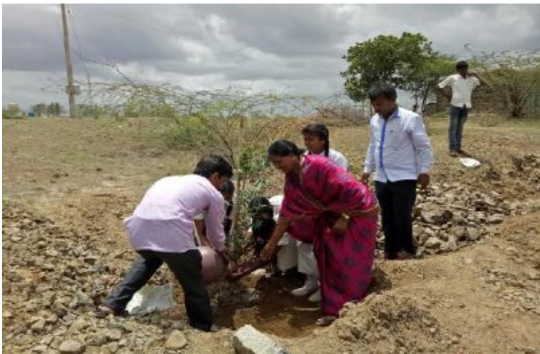
Watering the saplings