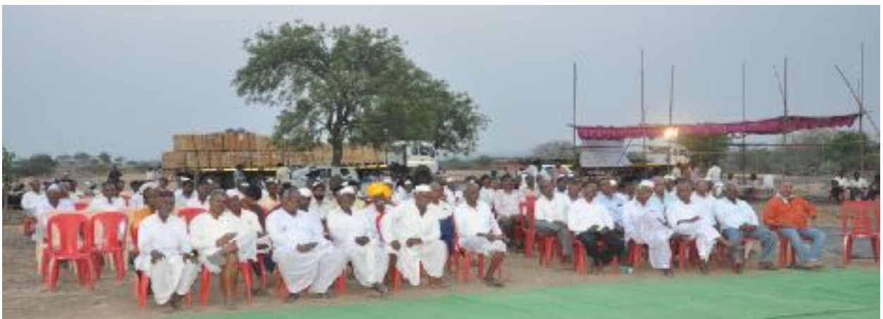
Participants from Bijjargi and neighbouring villages