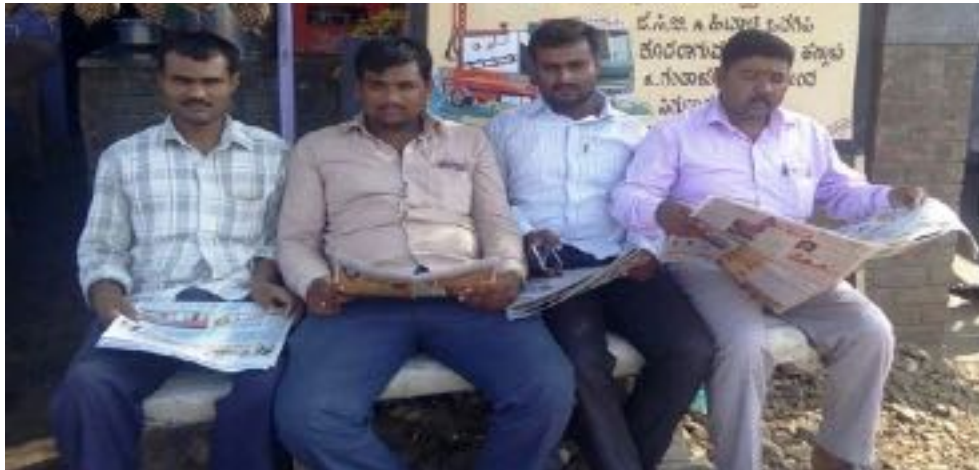
Benches in use – People resting and reading the morning newspaper

As Vijayapura (Bijapur) and Bijjargi Village is a hot and arid region, these benches will provide a welcome resting place for people waiting for buses or a meeting place.