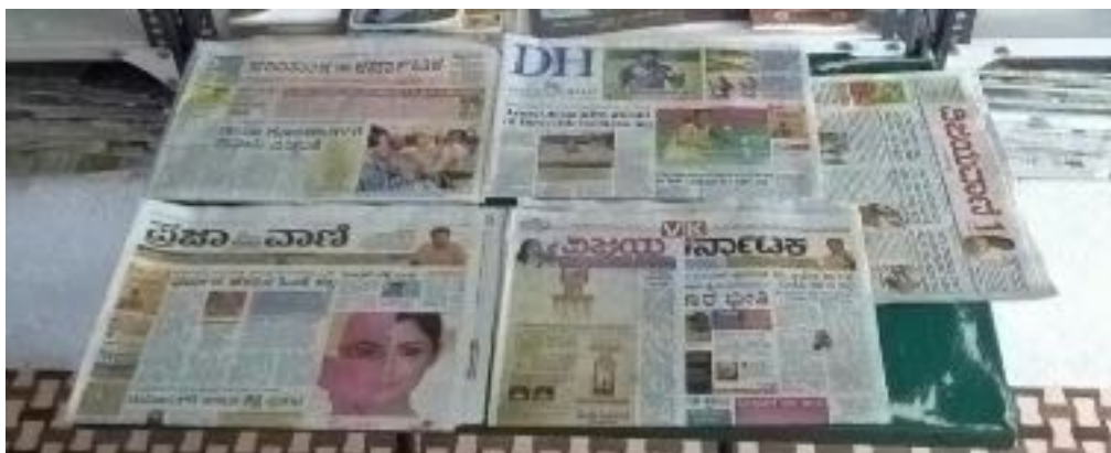
Newspapers in the Library