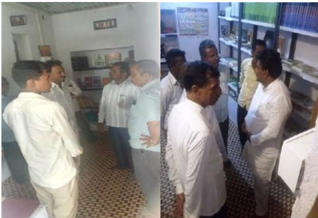
Visitors in discussion