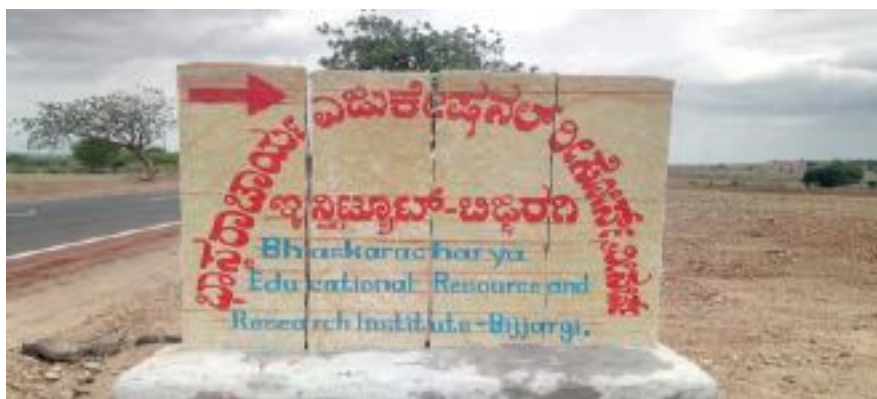
Sign board on the road showing direction to the Trust Office