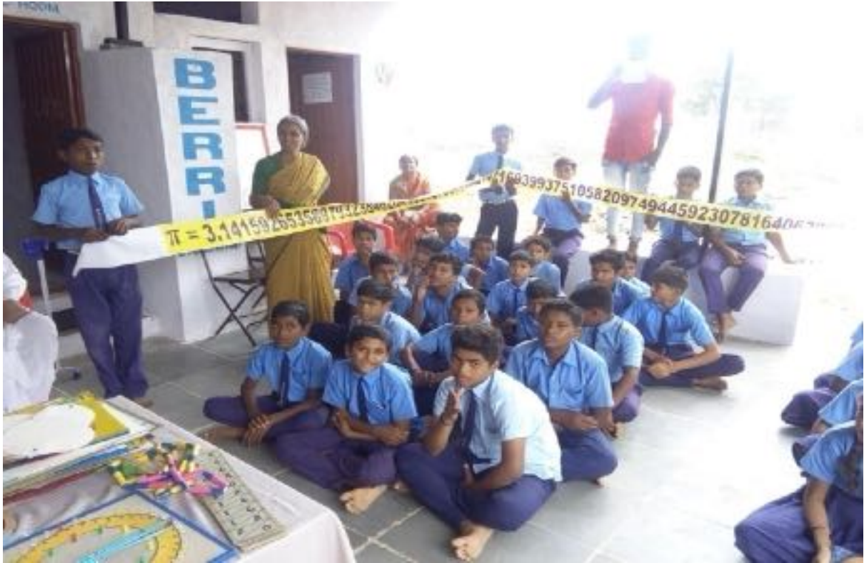
Value of \pi (Pi)