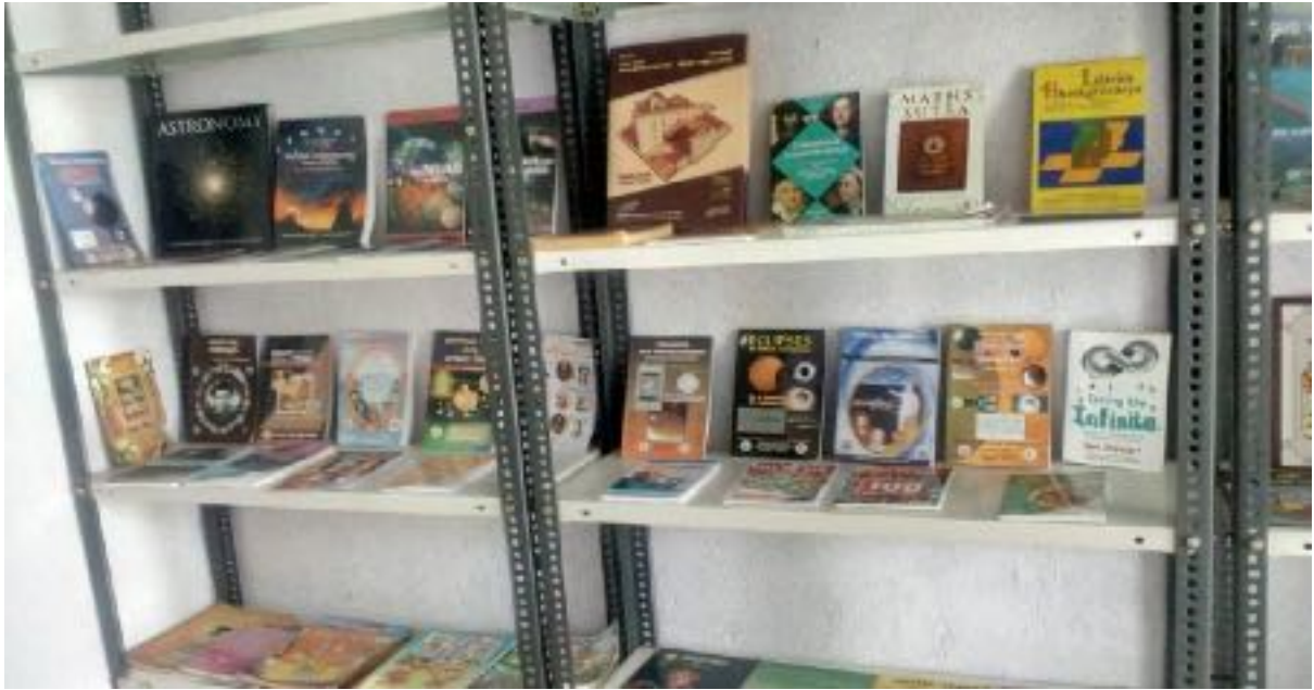
Books on mathematics and astronomy