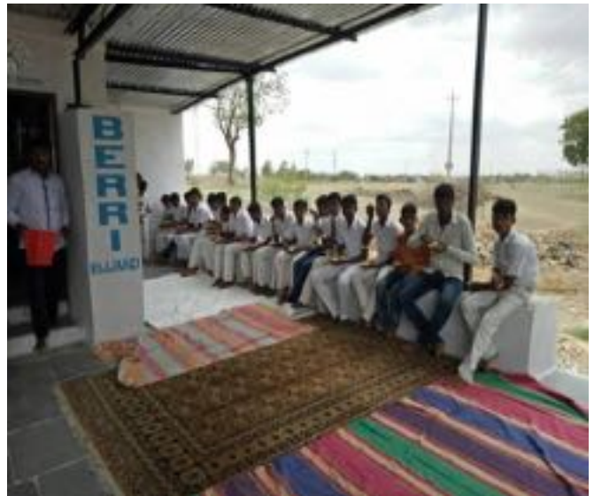
Children having snacks at Trust Premises