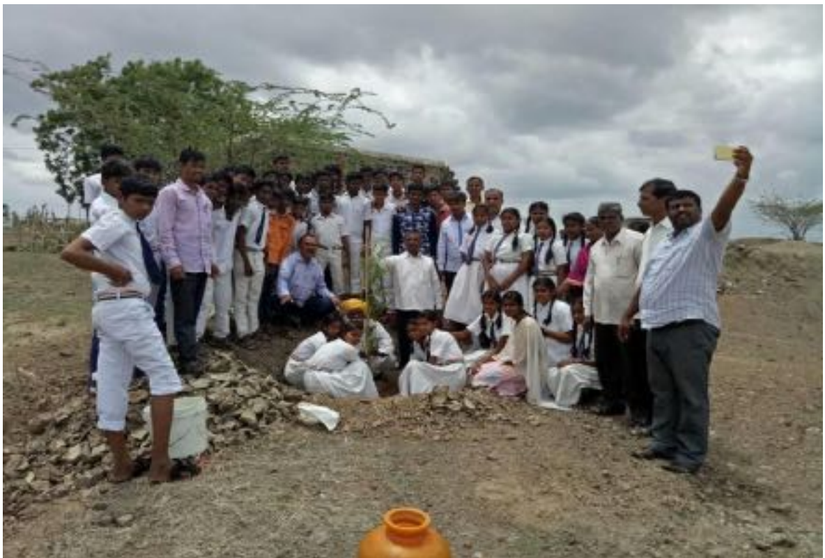
The whole group after planting