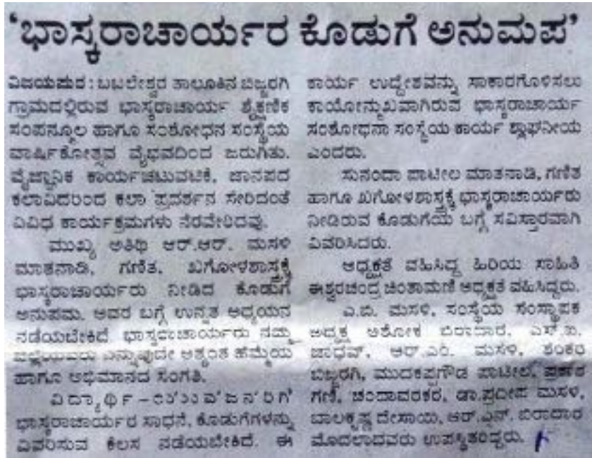
Article in Samyukta Karnataka 8 th April 2018