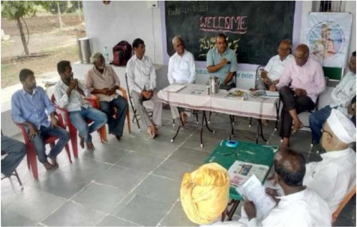
Participants engrossed in discussion