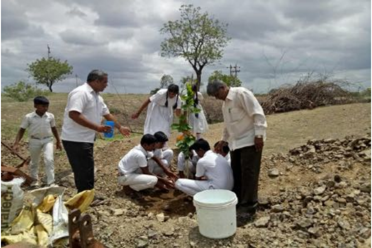
Nurturing the saplings