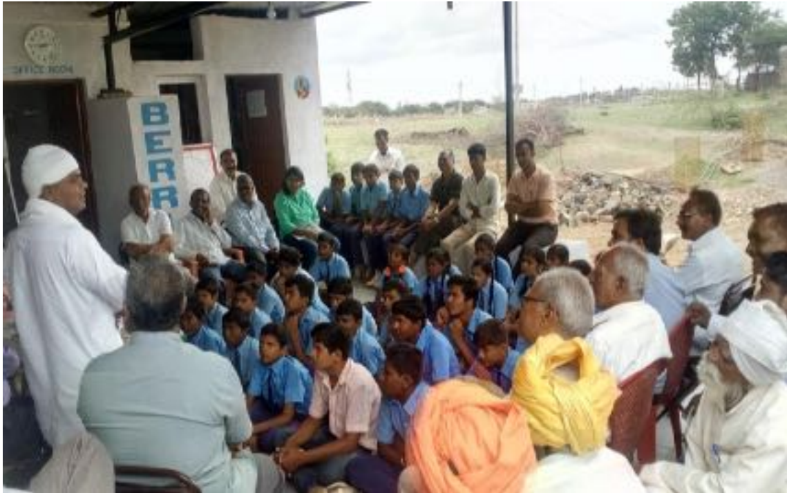
Children listening intently