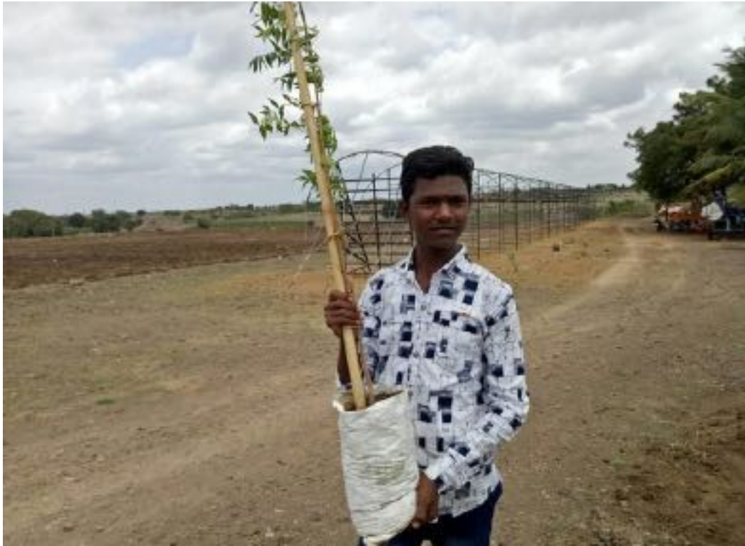
Finding a home for the neem sapling