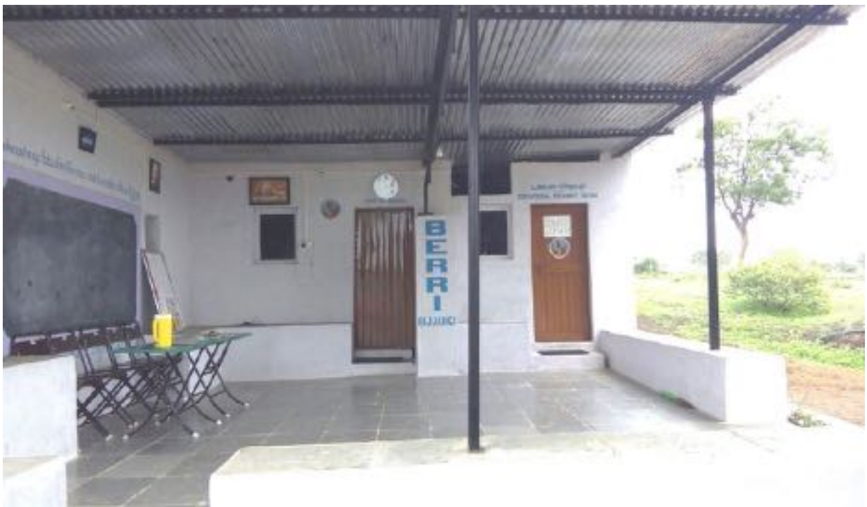
Side View to Berri-Bijjargi Trust Premises