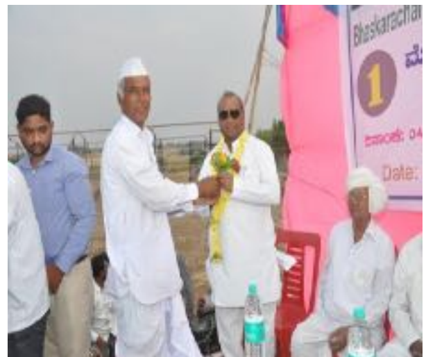
Felicitaton of seniors and Distinguished Guests on 1 st Anniversary Programme