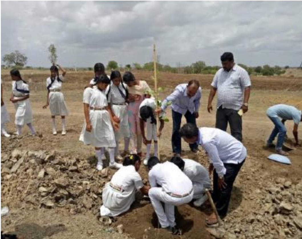
Students engaged in planting