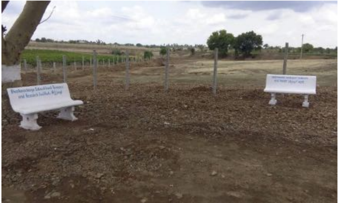
Second set of benches under the Ficus tree