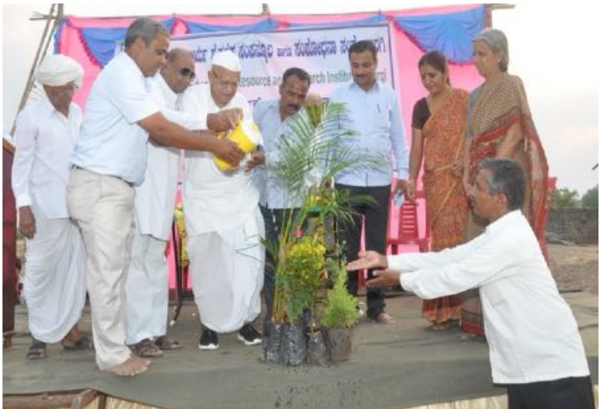
Inauguration of Anniversary day celebrations