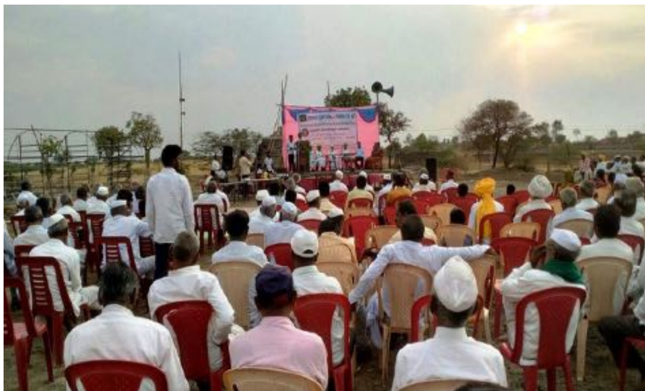
Program at the BERRI-BIJJARGI premises