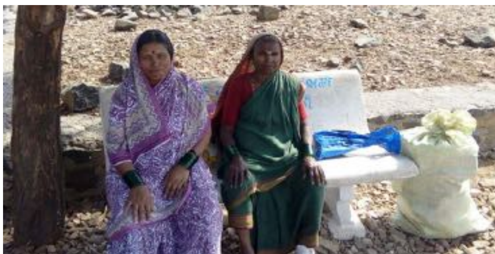
Women waiting for the bus