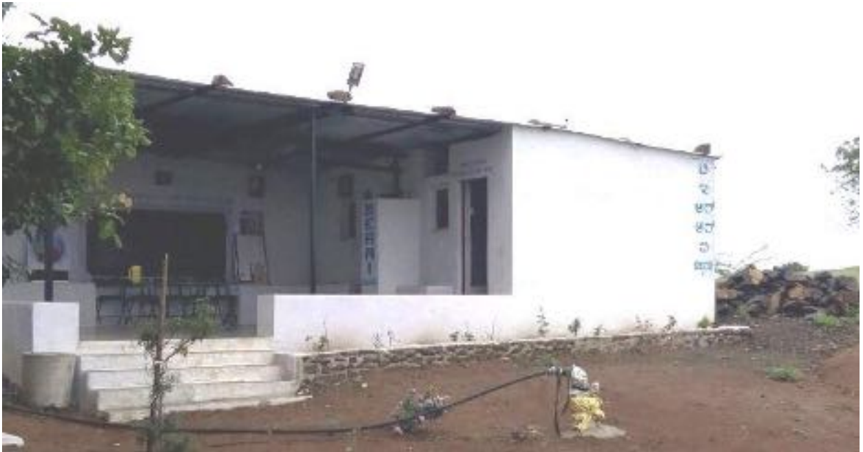
Entrance View to Berri-Bijjargi Trust Premises