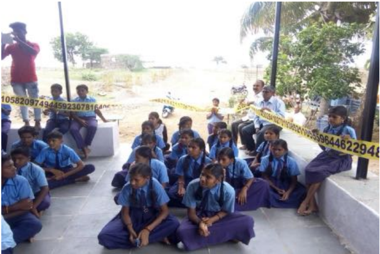
Never ending Valve of \pi (Pi)...