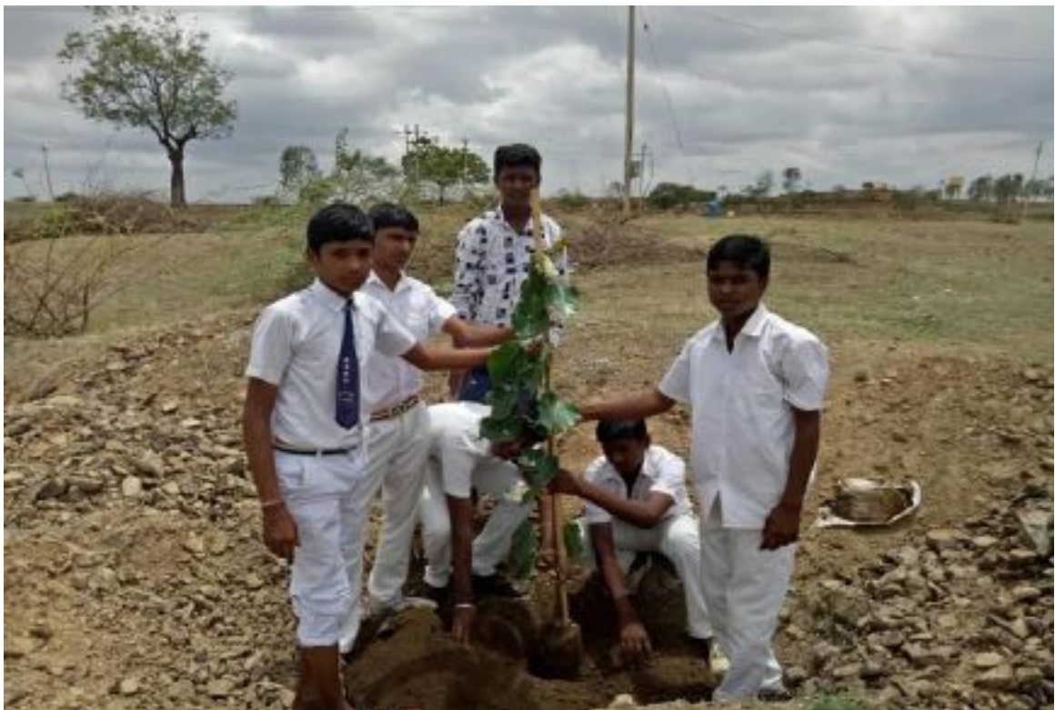
Together, with love