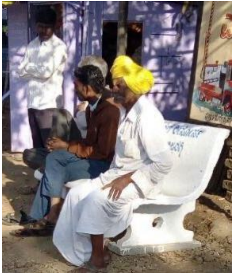
Benches in Use at Bijjargi Bus Stop