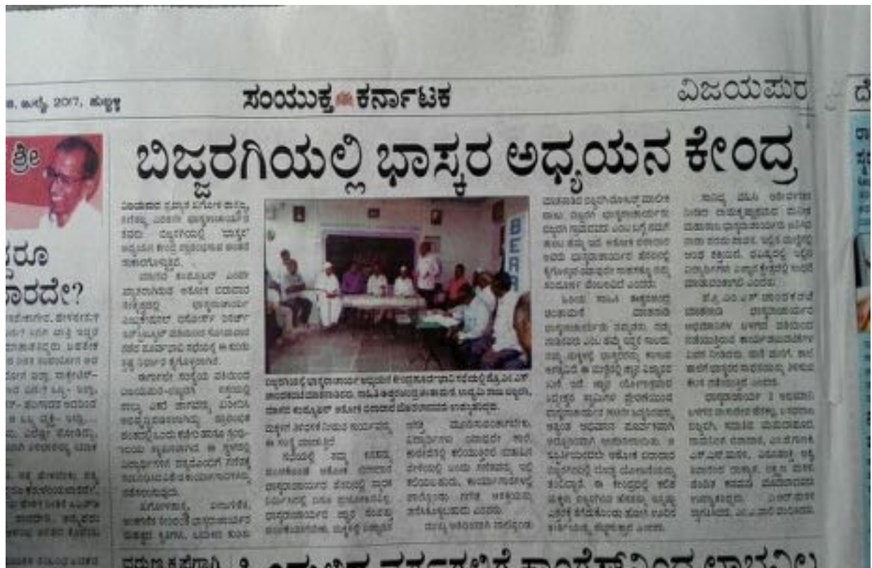
Article in Samyukta Karnataka Newspaper about the Trust on the 18 th of July 2017