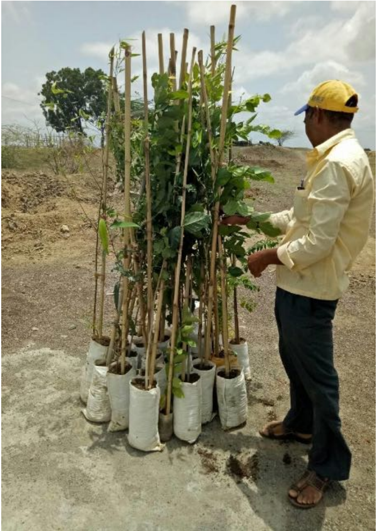
Saplings for planting