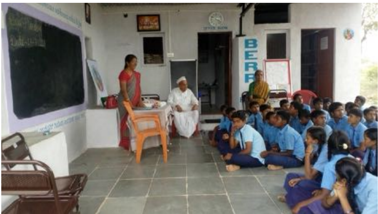
Facilitator is sharing with the students