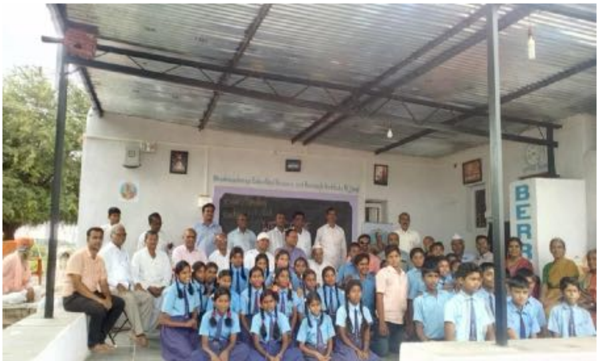
Whole group from the workshop