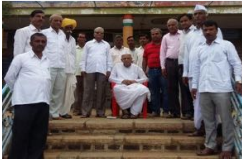
Group Photo after discussion about formation of the Berri-Bijjargi Trust in October, 2016