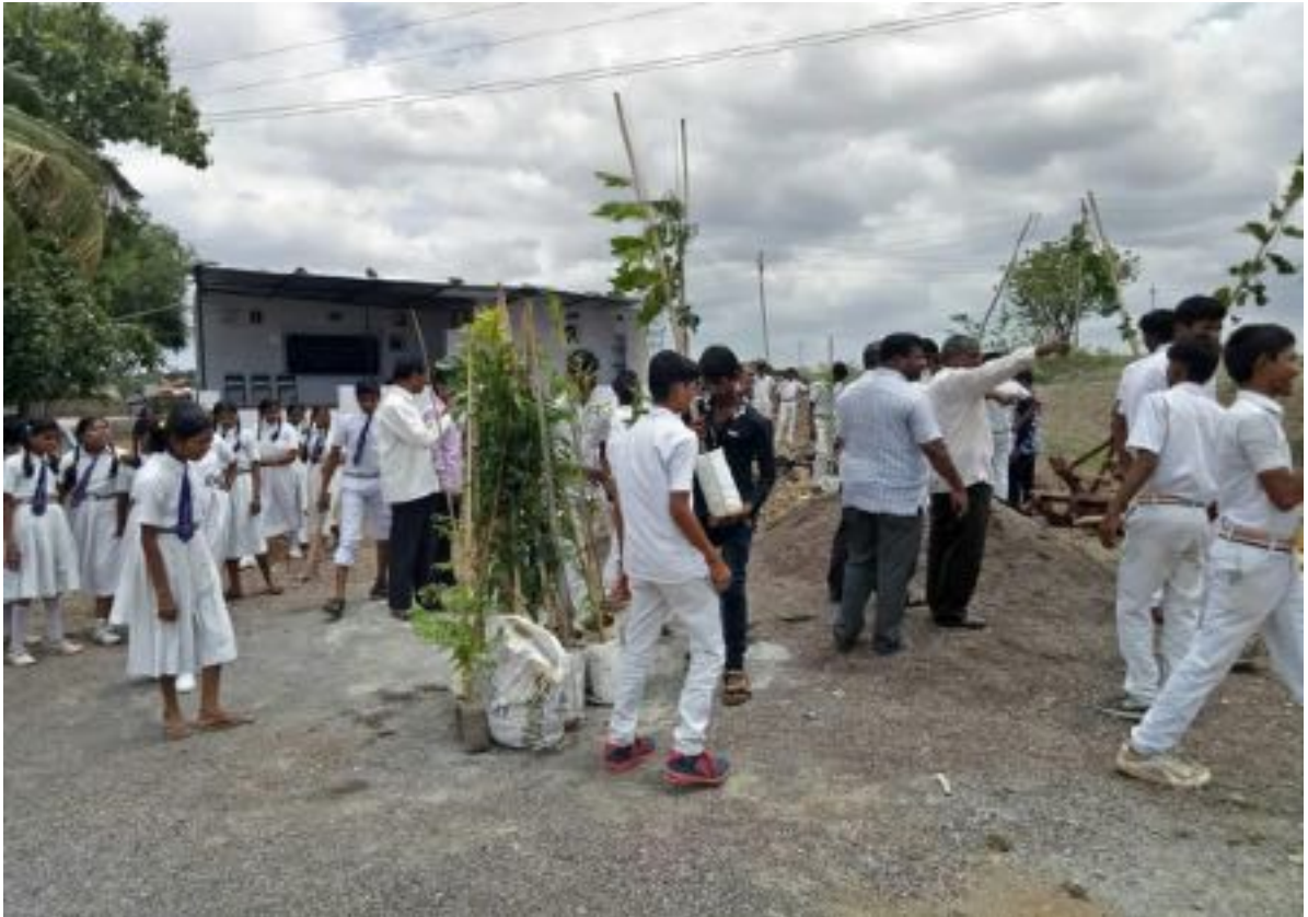
Children picking up saplings for planting