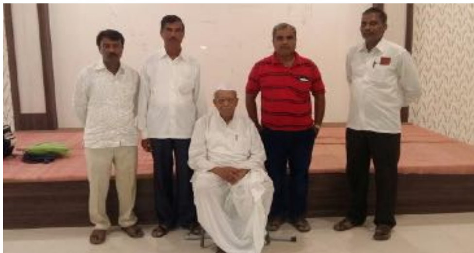
The Trustees of Berri-Bijjargi on the day of Trust Deed Registration 4th April, 2017