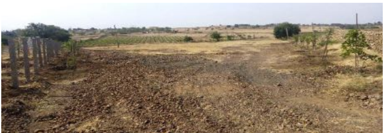
Proposed Campus Land Photo's