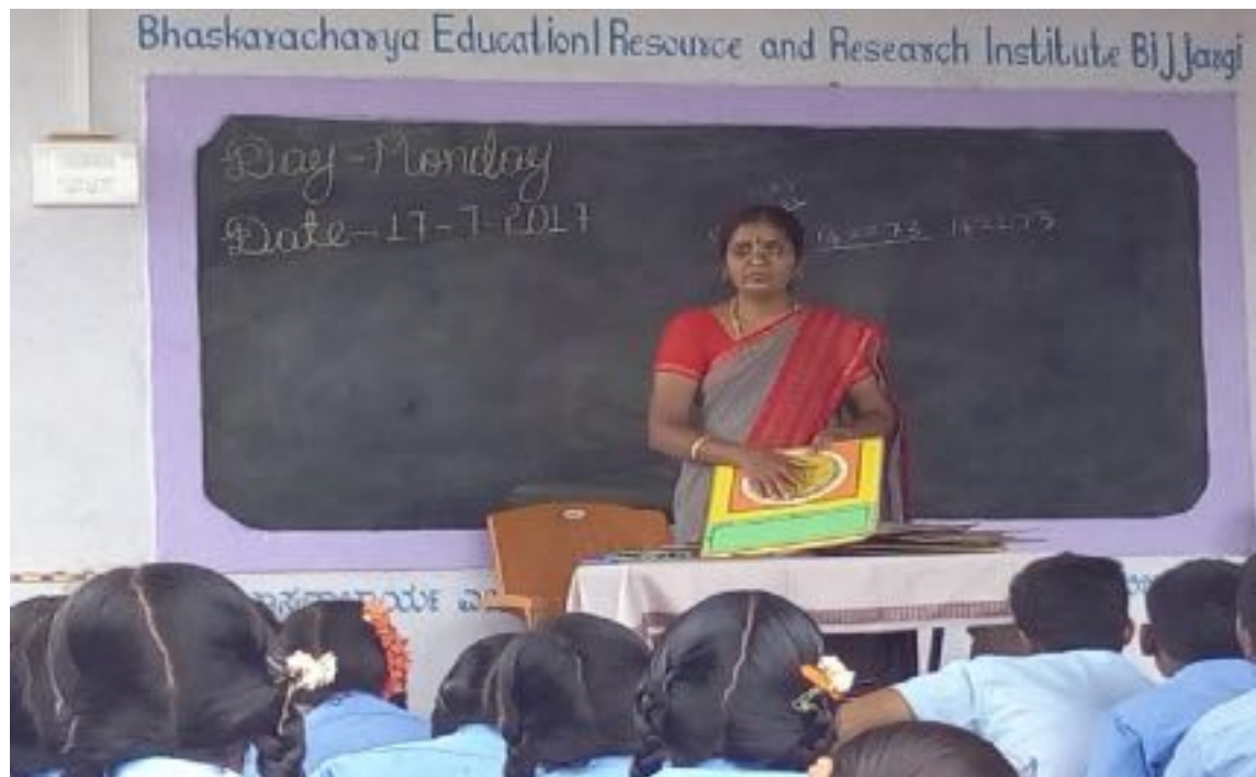
Demonstration of Teaching Aids